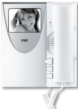
1715/1 Arco b/w video door phone

phone system containing costs and choosing an item with streamline, discreet design.