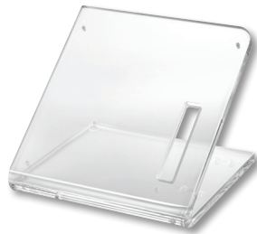
1715/50 Table-top kit for door phones